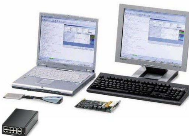
Figure 1: The NetHawk GSM Analyser is an effective and easy-to-use PC-based protocol analyser for real-time monitoring and analysis of GSM, GPRS, EDGE and SS7 networks.

For efficient GSM, GPRS, EDGE and SS7 monitoring, the NetHawk GSM Analyser is capable of analysing in real-time all the control and user plane protocols at the Abis, A, Gb, SS7, Gn, Gp, Ga, Gs, Gi, PSTN, Location Services (LCS) and High Speed Signalling Link (HSL) interfaces.