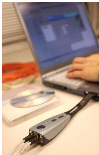
Figure 4: It only takes a few moments to install the NetHawk GSM Analyser software and plug-in the NetHawk Adapter(s) to the PC. Then your NetHawk GSM Analyser is ready for use.