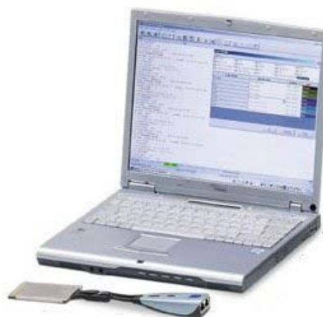
NetHawk BSC/Abis Simulator software and NetHawk N2 Adapter