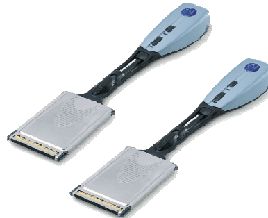
NetHawk BSC/Abis Simulator supports two NetHawk N2 Adapters