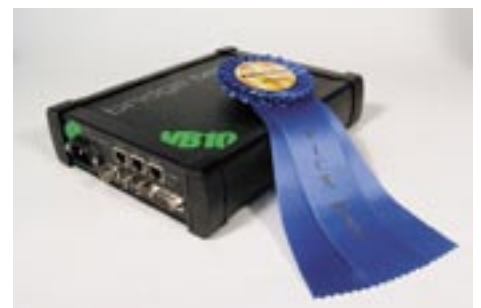
The VB10 IP-PROBE won Broadcast Engineering's exclusive annual Pick-Hit award for most innovative product in its class at NAB 2005 in Las Vegas.